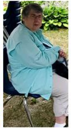
Enjoying the Day!